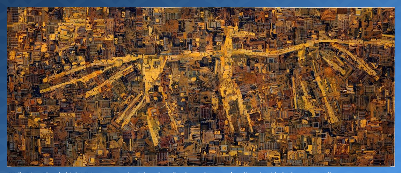
Wally Dion, Thunderbird , 2008, computer circuit boards, nails, plywood support (acrylic stain: sides).