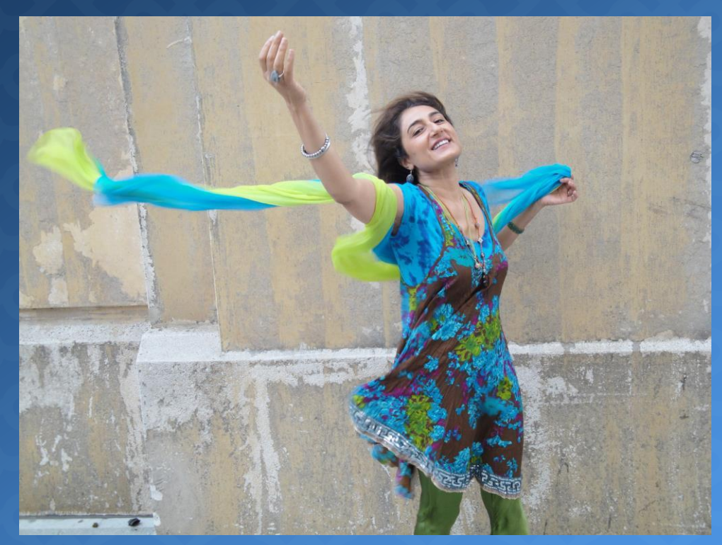
Kiran Ahluwalia.