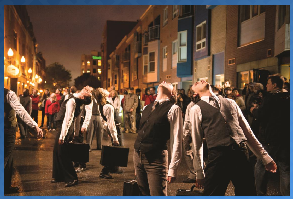
Où tu vas quand tu dors en marchant...?, 2013, production of Carrefour international de théâtre, Québec.