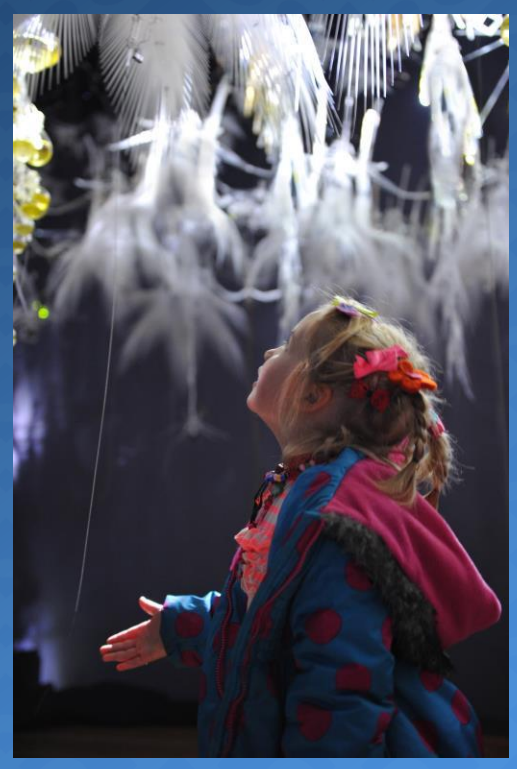
Philip Beesly Architect Inc., Hylozoic Ground at the Venice Biennale