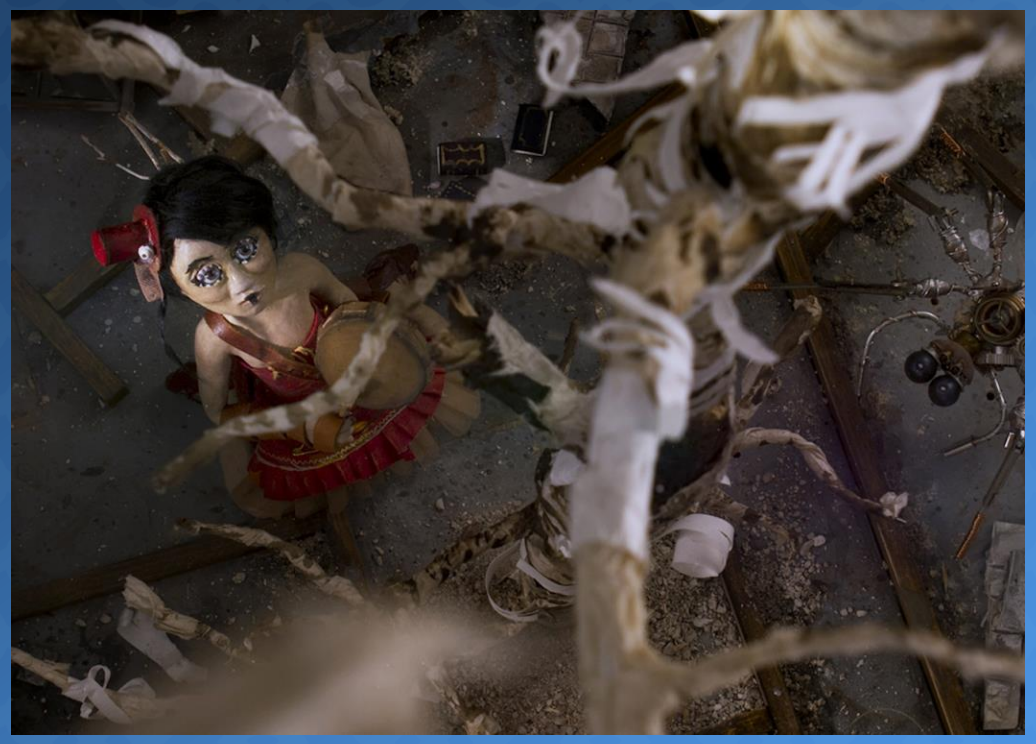
Amanda Strong, Indigo , 2014, one of the Canadian Aboriginal films presented during the European Film Market of the 2015 Berlin International Film Festival.